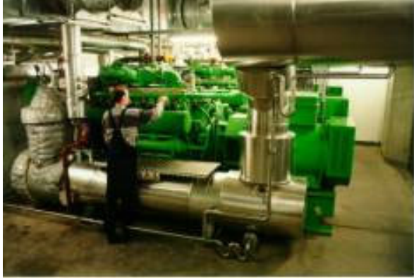
CHP FROM THE BOTANICAL GARDEN

Until year 2002 there are 70 decentralized CHP plants with a total power of 24.000 kW electrical power. The motors, mostly based on natural gas, range from 5 kW to 4000 kW. Small and medium CHP plants are operated in municipal buildings, kindergartens, old people's homes, industry and some district heating networks. In office buildings and hospitals CHP plants are often combined with absorption cooling machines (tri-generation). A 50 kWel CHP plant in an old people's home uses a condensing heat exchanger. The 800 kW CHP plant in the botanical garden is combined with a new invented "high temperature condensing unit" based on an absorption process raising total efficiency to more than 95%. In a field test the utility MAINOVA operates a 4-9 kW Stirling engine. There is an 200 kWel ONSI fuel cell and an 100 kWel micro-gas turbine in two swimming pools.